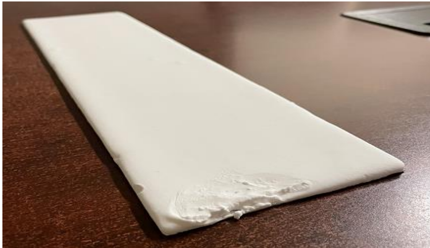
Insulation Render > Coated on Metal Panel - White