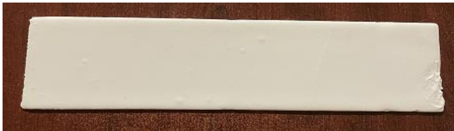
Test Surface Side of the Panel